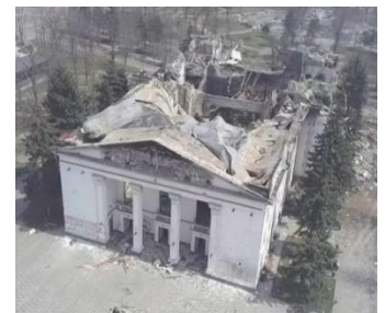
Destroyed Mariupol theatre