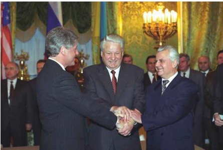
President Clinton, Yeltsin and Kravchuk

A PEACE TREATY: Russia has never adhered to any treaty it has signed in history. Making treaties with Russia is seen by Russia as a weakness to be exploited. Even on the eve of its February 2022 invasion, Russia vehemently denied any intention to invade Ukraine but did so, violating all its previous agreements - the Budapest Memorandum, Minsk 1 and 2. History has proven that Russia cannot be trusted to abide by any agreements it signs.