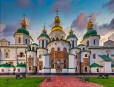
Saint –Sophia Kyiv

According to various archeological sources, Kyiv is at least 4,000 years old. Most great cities and Empires were established on trading routes and Kyiv was located on the Dnieper River and was a transit point to the vast territories of the south, east and west.