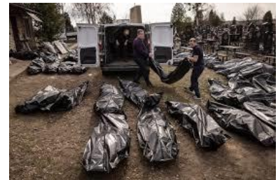
Bodies exhumed from mass graves in Bucha