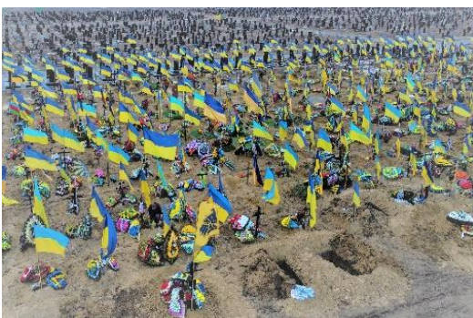
Cemetery near Kyiv

The Ukrainian army has an active strength of 800,000 personnel of which 42,000 are women . Ukraine does not provide actual figures of deaths or injured. However, according to estimates maybe 30,000 -70,000 Ukrainians have been killed and 100,000 wounded . Every family in Ukraine has been affected by the death of family members. The average age of soldiers in the Ukrainian army is 43 as the government has limited the use of young men and women to fight. In the Vietnam War, 58,220 young Americans were killed and their average age was 23 .